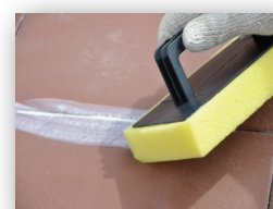
Installing the Grout

temperature, etc.) or highly absorbent substrate can reduce the open time, even to just a few minutes]