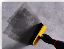
Make sure the surface is clean