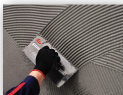
Spread paste onto the substrate