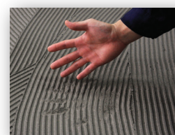
Adhesive bed is no longer sticky - "Skin-over"