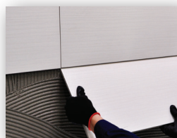
Place tile on the adhesive bed

- Spread no more than 1m 2 at a time to prevent Skin-over. In normal ambient temperature and humidity conditions, the open time of Ezi STAR FLEX 2in1 is approx. 20 minutes. [ Note : Unfavourable weather condition (e.g. extremely hot, strong wind, high