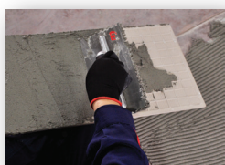
Spread paste on the back of tile